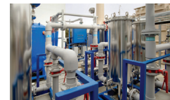
RECIRCULATION, MIXING, FILTRATION, ETC.