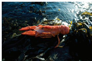
AQUACULTURE LOBSTER FARMING — FISH PONDS

After initial prime the Series 'G' pump will lift up to 10 vertical feet (3.1m) and will remain primed even after shutdown. This pump also features an open, non-clogging impeller which is molded in conjunction with the shaft sleeve, thus isolating the shaft from solution contact. The self-priming ability, chemical resistance, light weight and basket strainer make this an ideal chemical transfer, waste treatment, emergency/backup or filter pump.