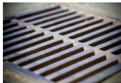
PUMPING FROM PONDS, PITS, TANKS, SUMPS, ETC.