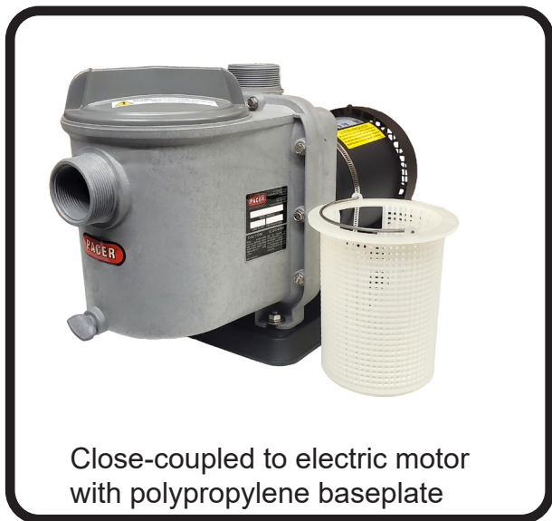
Close-coupled to electric motor with polypropylene baseplate

The self-priming Series 'G' pump is made in either Noryl® or Ryton®, providing a maximum range of chemical resistance. It is available with stainless steel internal hardware or complete non-metallic solution contact. The pump comes standard with stainless steel external hardware. It is protected with a basket type strainer in either Polypropylene or ECTFE. The large cover makes initial priming and removal of the strainer quick and easy. The cover is the same material as the pump or it can be ordered in clear Lexan®.